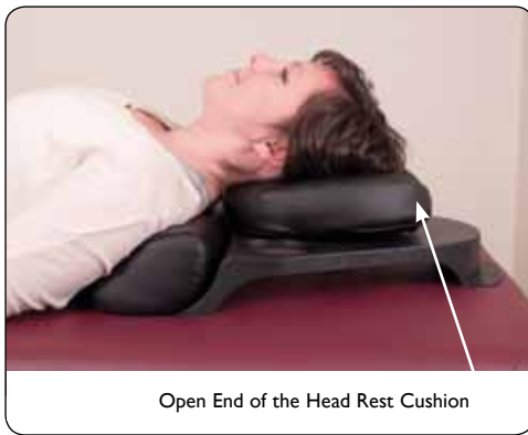
Open End of the Head Rest Cushion

The Head Rest Cushion can be used to facilitate comfort and support when the client is lying in a supine position by turning the cushion around on the platform so that the open end points away from the client. This angle provides cervical support to the client when in a supine position. (see Fig 3)